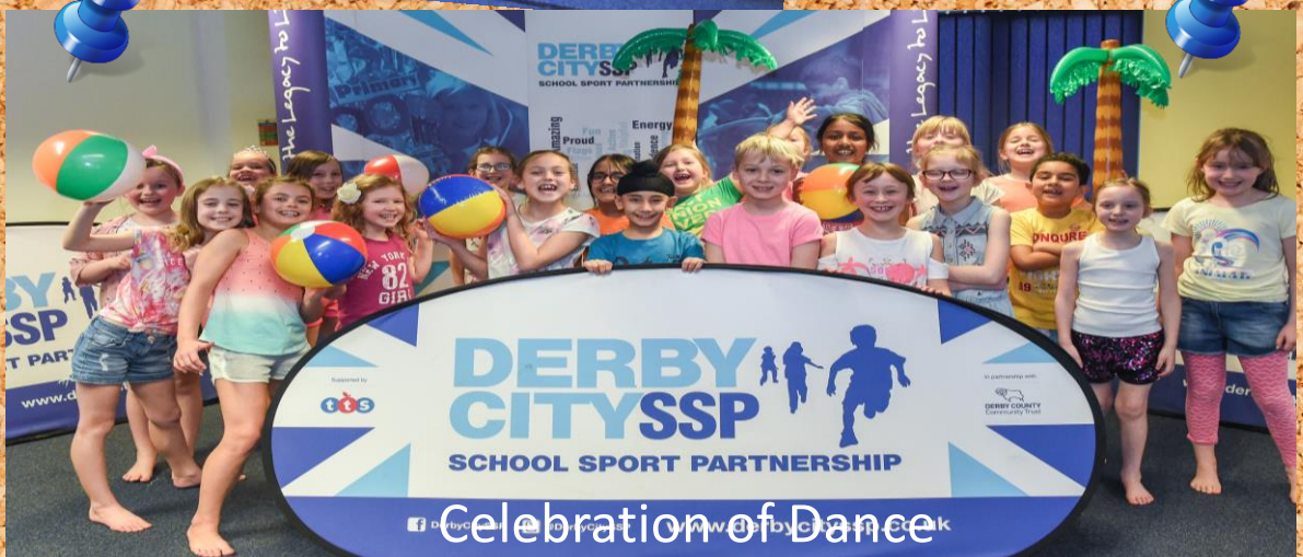
Celebration of Dance