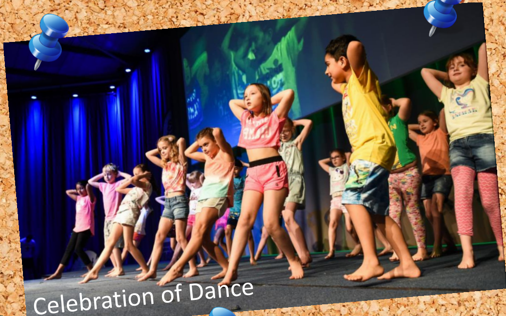
Celebration of Dance