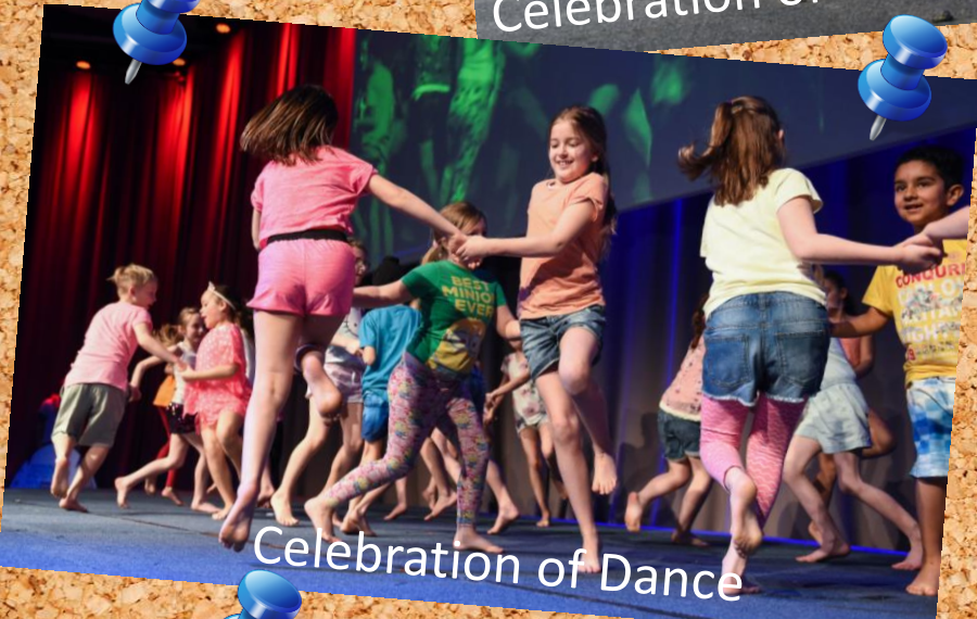
Celebration of Dance